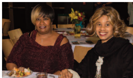
Relaxing before the keynote presentation.