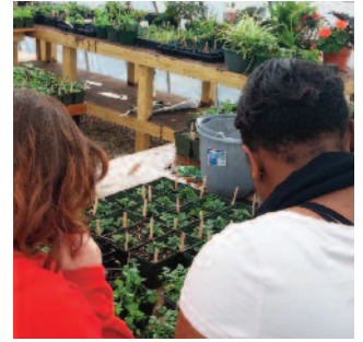
Teens work in Osterlein garden.