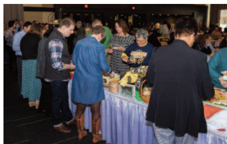
The buffet was delicious!

Mark your calendars for Wednesday, March 14, 2018 for our next CHF Celebrates at "Spring into Wellness!" at the Clark State Hollenbeck Bayley Arts and Conference Center.