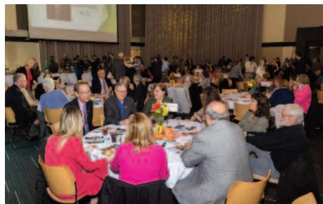
Over 250 people attended the Annual Reception.