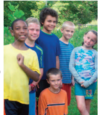
Big Brothers, Big Sisters of Springfield at camp.