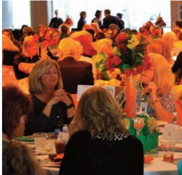
Guests enjoy the reception.