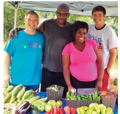
Selling their produce in the Promise neighborhood.