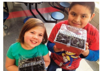
Lincoln Promise students start seeds.