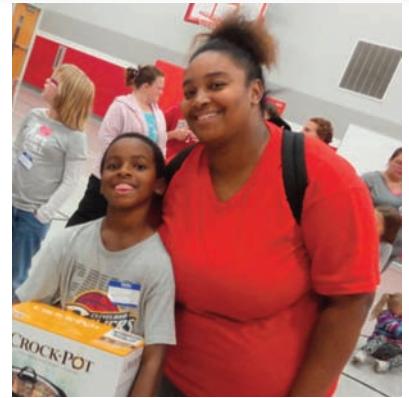
Families use slow cookers to prepare healthy meals.