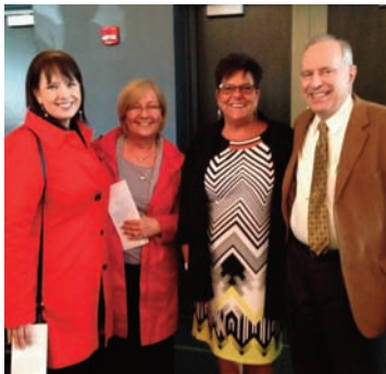
Guests mingle at the reception.